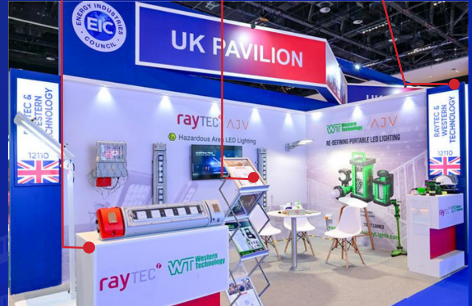
Fascia Name Board