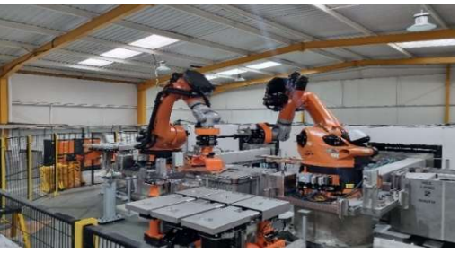
KUKA Robots during FAT in Halesowen

The programme uses co-developed, targeted survey questions to measure collaboration, relationships and trust, focusing on communication, mutual respect and teamwork. The feedback data is used to identify and resolve immediate and emerging issues and support LfE and opportunities for improvement. Supplier feedback scores are monitored and reported monthly to show variance from previous reports, with additional feedback-sharing sessions taking place with BEPDT JV managers and project leaders. After two years of implementation, the SRM programme is now an established and valuable tool for addressing and resolving issues that arise within the project. The wide base of feedback data is useful for identifying areas for continual improvement and the SRM team is readily available to rapidly respond as any new issues emerge across the project.