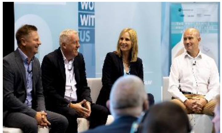
The KDP Panel at the NDA Group Supply Chain Awards