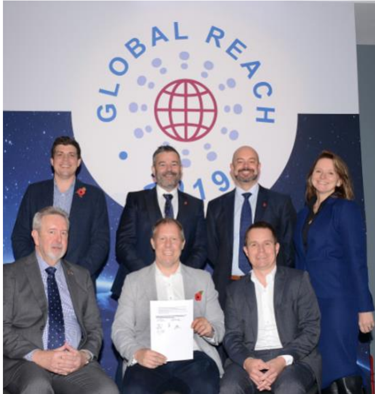
6th November 2019 Global Reach